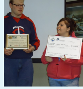
ACGC (above) and WWG (below) accept their 1st-place awards at the YES! Earth Day Celebrations

YES! empowers youth to partner with their community to create economic and environmental vitality through hands-on learning and team-based projects.