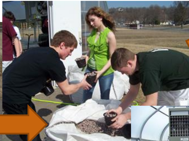
Putting grow stones in mesh pots