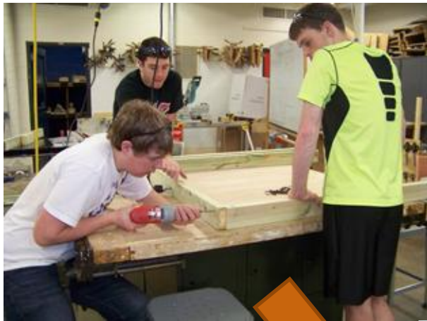
Building of Aquaponics stands