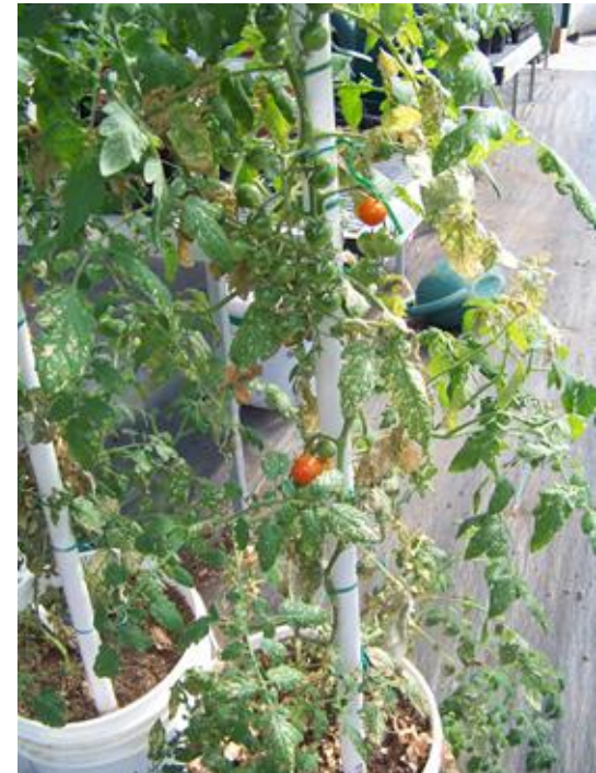
Hybrid salad tomatoes