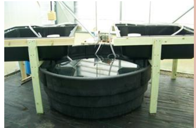
Assembling of Aquaponics