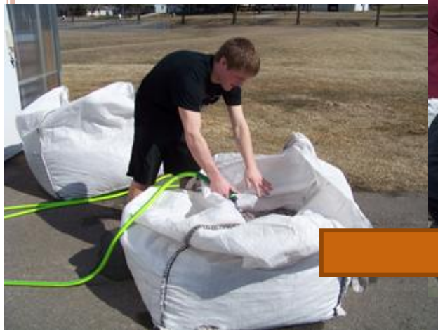
Cleaning grow stones