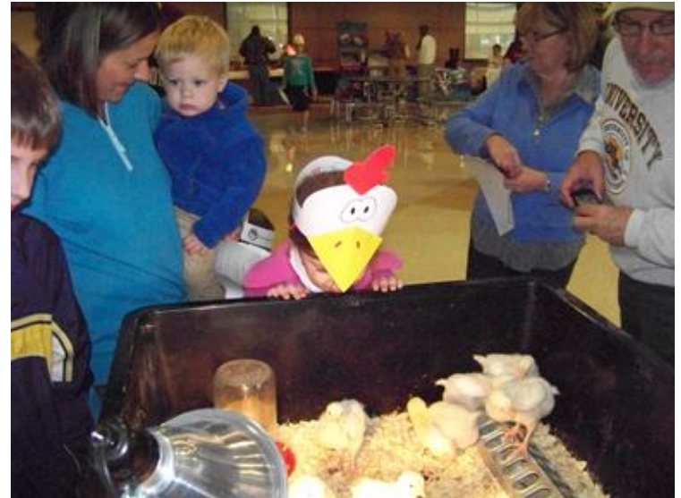
Baby chick display