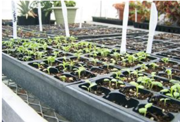
Students planting lettuce seeds