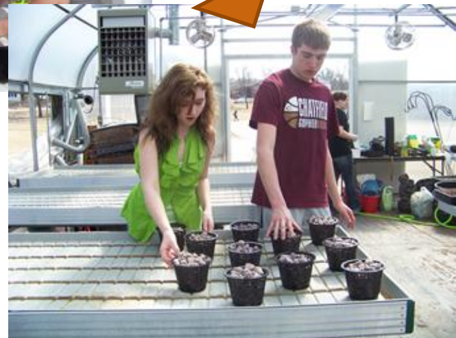
Placing mesh pots on ebband flow benches