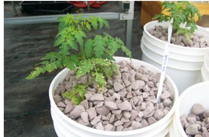
Tomatoes in our left over substrate