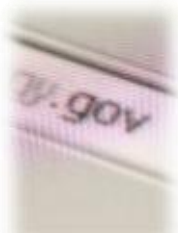
website screen shots