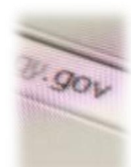
website screen shots