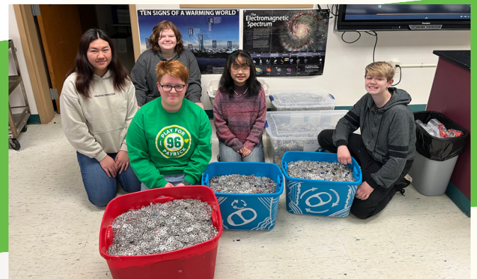
Westbrook-Walnut Grove pop-tabs collection

Was awarded monies for projects. Brought recycling bins into elementary school and art room to promote marker recycling. Reduced waste at school by displaying signs for recycling at sporting events and on garbage bins in school parking lots.