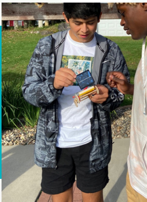
Two students assembling solar cars to learn about renewable energy at Fall Summit in Spicer, Minnesota.

"I learned so much about the opportunities I have to help the planet within my very own community. Although I didn't get to go to all the [events], I learned a lot from others on the Team. I liked feeling so connected with others over saving the planet." (Junior Student, Sleepy Eye YES!)