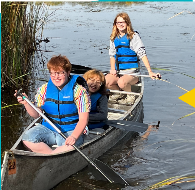
Three students from WWG paddling canoe at Fall Summit in Spicer, Minnesota.