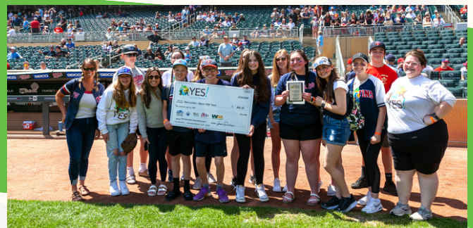
New London-Spicer - Water Stewardship Award

Continued a legacy project of spreading prairie seeds to help contain and buffer water from their parking lot at school. Worked with the Middle Fork Crow River Watershed district to paint "No Dumping - Drains to River" on storm drains in their community.