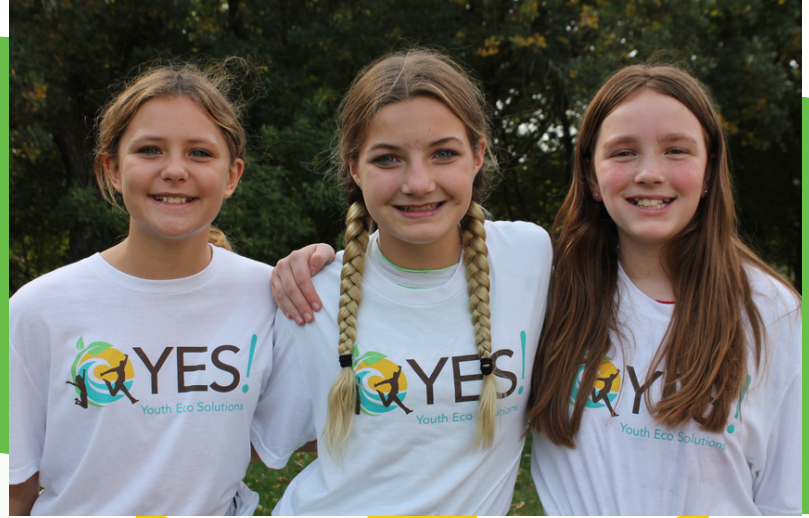
Three students at Fall Summit in Spicer, Minnesota.

Since its inception in 2007, YES! has supported over 4,700 students in working with more than 7,250 local businesses, organizations and experts to impact an additional 345,848 students and community members.