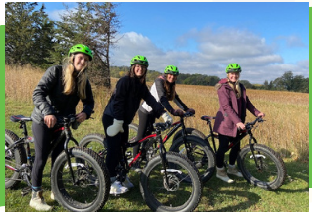
Four students exploring native prairie on fat-tire bikes.

Major funding for the 2021-22 season of YES! was provided by the Minnesota Environment and Natural Resources Trust Fund (ENRTF), Launch Your Future Today (LYFT), Waste Management, and Great River Energy. Thank you!