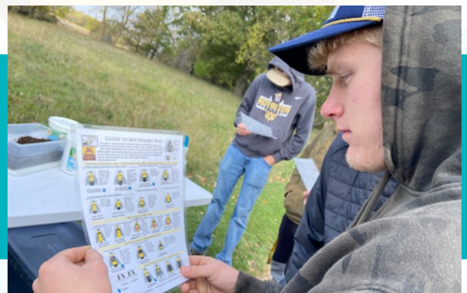
Student from Royalton identifying bumblebees at Prairie Woods Environmental Learning Center in Spicer, Minnesota.