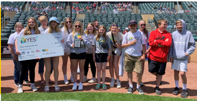
Sleepy Eye - State Champion

Expanded pollinator habitat at a golf course by planting prairie seeds on 2.7 acres. Developed and installed educational signs for pollinator gardens. Collected 70 pounds of used crayons, pens, and markers and 1,078 pounds of used holiday lights for recycling.