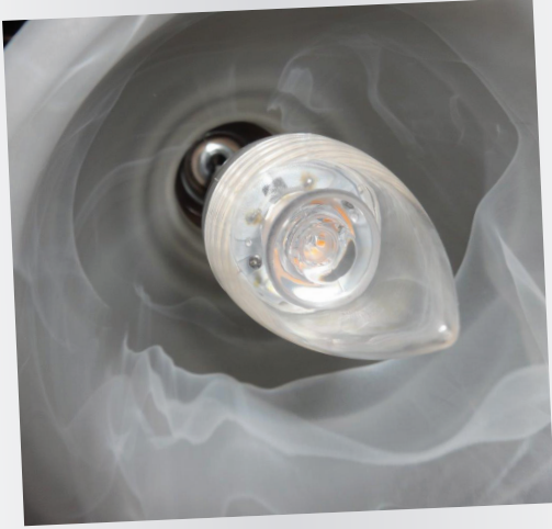
Si aad u sameyso: Isku bedel nalalka LED-ga