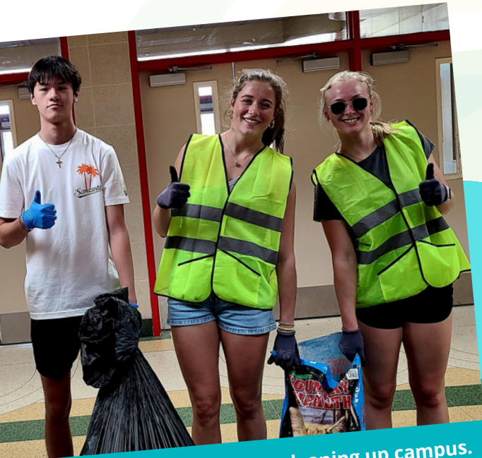
Mankato West YES Students cleaning up campus.