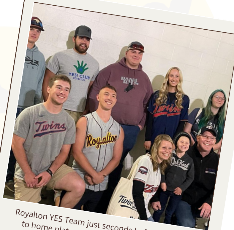
Royalton YES Team just seconds before walking to home plate of Minnesota Twins Stadium and becoming the 2022-23 YES State Champion.