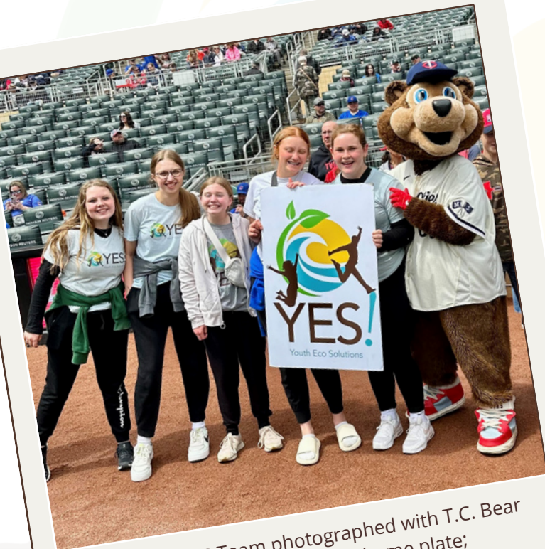
Sleepy Eye YES Team photographed with T.C. Bear on the Minnesota Twin's home plate; they were announced 2022-23 YES Runner-Up State Champion.

Created a pollinator garden and established a bee hive in order to educate elementary students on the importance of pollinators. Continued to maintain and protect their school garden by putting up permanent poles, using a water tank and partnering with 3rd through 5th graders in order to plant and maintain the gardens.