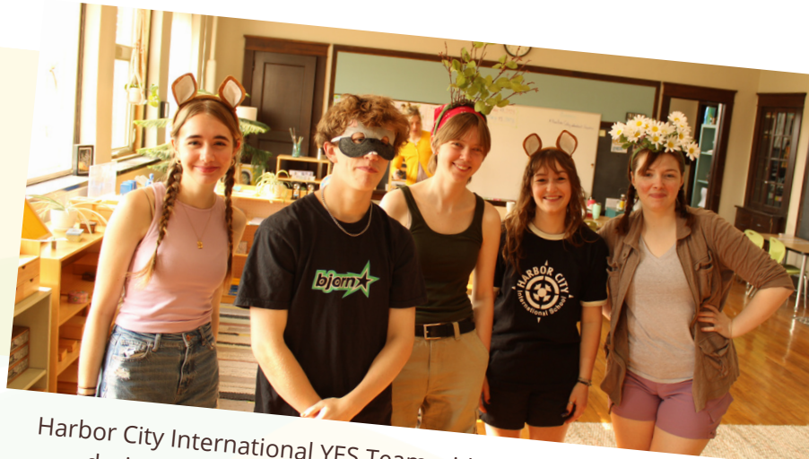
Harbor City International YES Team with food web props. Taken during their Many Rivers Montessori Water Workshop.

Since its inception in 2007, YES has supported over 4,910 students in working with more than 7,303 local businesses, organizations and experts to impact an additional 365,093 students and community members.